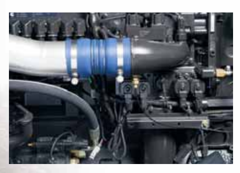
Electronic fuel control provides the T9000 engine with the exact amount of fuel at precisely the right time for optimum fuel efficiency.